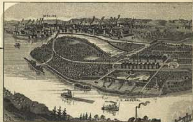
VIEW OF U. S. ARSENAL