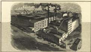
DAVENPORT SYRUP REFINERY.