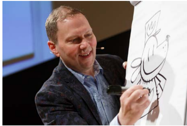
"Dog Man" series author Dav Pilkey gives a presentation to local students, October 11, 2019.

Did you know that the Library of Congress holds over 140,000 issues of comics, the largest publicly-available collection of comic books in the United States? Use the Library's comic collection as inspiration for becoming your own comic creator!