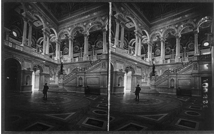
"[The Great Hall of the Library of Congress – man standing in center, looking up, and woman seated on bench],"